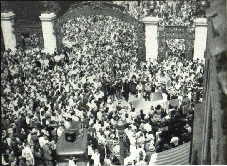
PEACE: Scene from 1936 strike against war at U. of California as the A. S. U. led 500,000 students throughout nation in great peace demonstration.