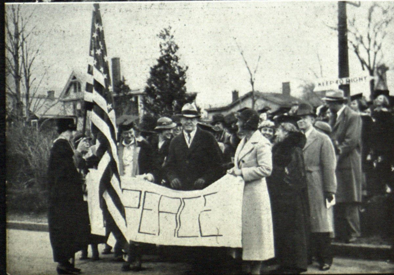
DEMOCRACY: The A. S. U. fosters cooperation between students and liberal educators to revitalize curriculum and combat reactionary pressure. Scene shows President MacCracken of Vassar joining peace parade.