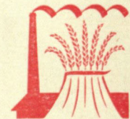
Communist Party Emblem