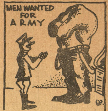
ARMY MED. OFF. "AT LAST A PERFECT SOLDIER!"